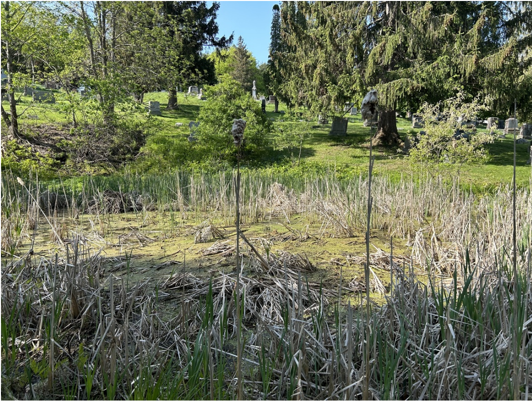
Photo: the pond at New Forest Cemetery before rehabilitation: full of sediment and vegetation - hardly a "pond" at all.