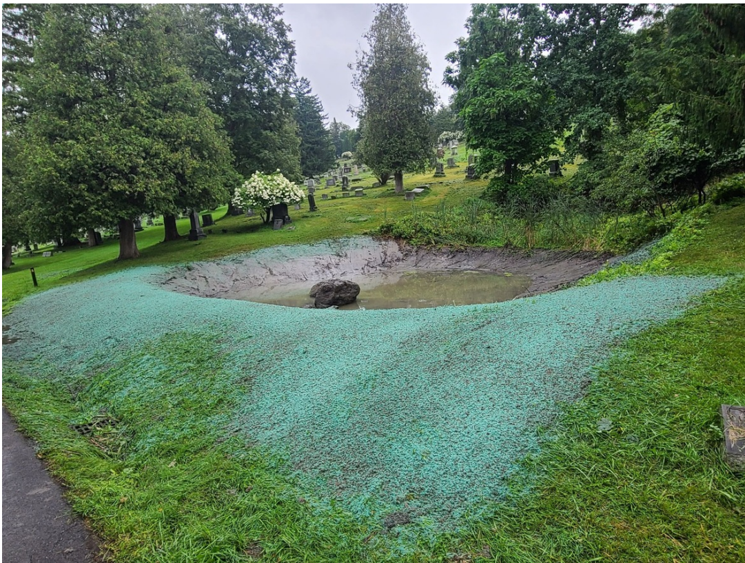
Photo: the pond in New Forest Cemetery after being cleaned out, with new grass seed planted.

to that, a woman, Alecia Pendasulo, who cares about our history and the cemetery brought it to my attention that the little pond inside the Cemetery was in bad shape - it had filled in with sediment and vegetation. I asked one of our City engineers to assess it. I wanted to know whether cleaning it out could contribute to our efforts to mitigate against flooding in South Utica. She assessed it and determined that the pond was not functioning as it should, to both act as storage after heavy rains and to allow excess water to enter our storm drain system more slowly. All this is good for the City, so the Mayor agreed to allow the City to pay to have the little pond cleaned out. We obtained an easement from the Cemetery to have the work done, and last week a City-hired contractor got in there, drained the pond, dredged it of years' worth of silt and sediment. Before too long, the pond will fill up again, the grass along its banks will grow, and it will once again be a beautiful and functional part of its surroundings.