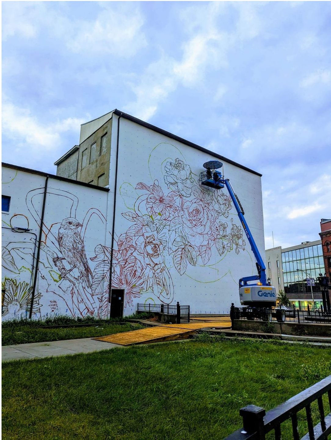
Photo: early stages of our new mural downtown, painted by artist Steven Teller