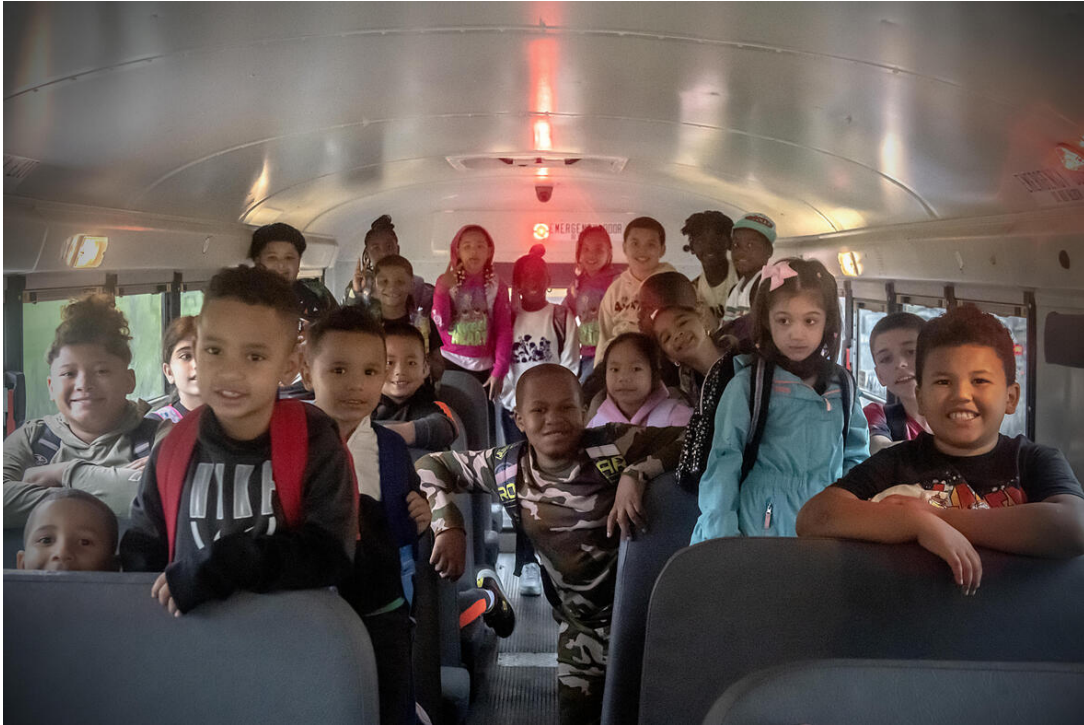
Photo: a photo of happy school children on a bus on their way to school

the School Board continues to have lots of important work to do as we transition away from the Karam years. But I have great confidence in our School Board, and great hope for the future of our district.