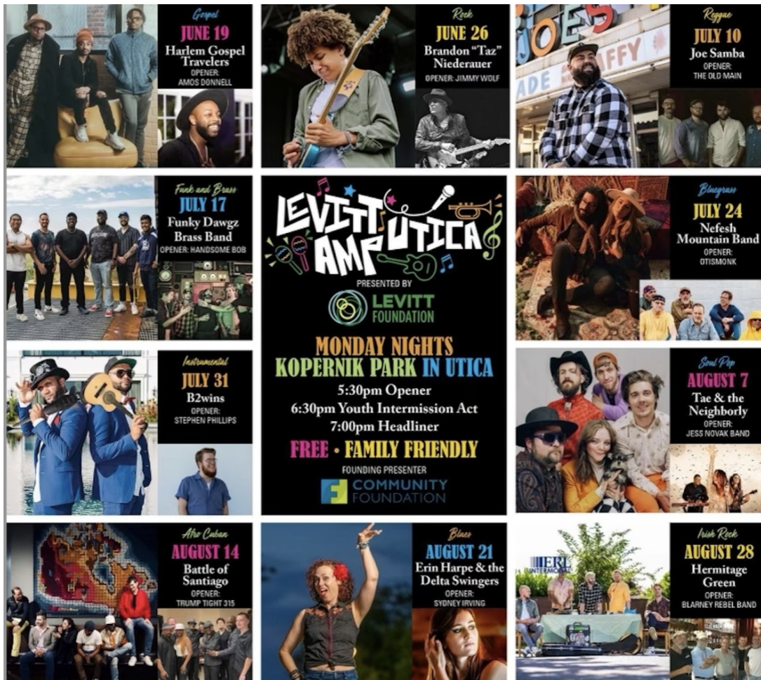
Photo: a collage of performers and bands coming to Kopernick Park this summer.

(The first concert in this series, was a huge success. The Park was full, the crowd was happy, it was like a big, happy family reunion. And there was great dancing! But I have got to practice my moves.....)