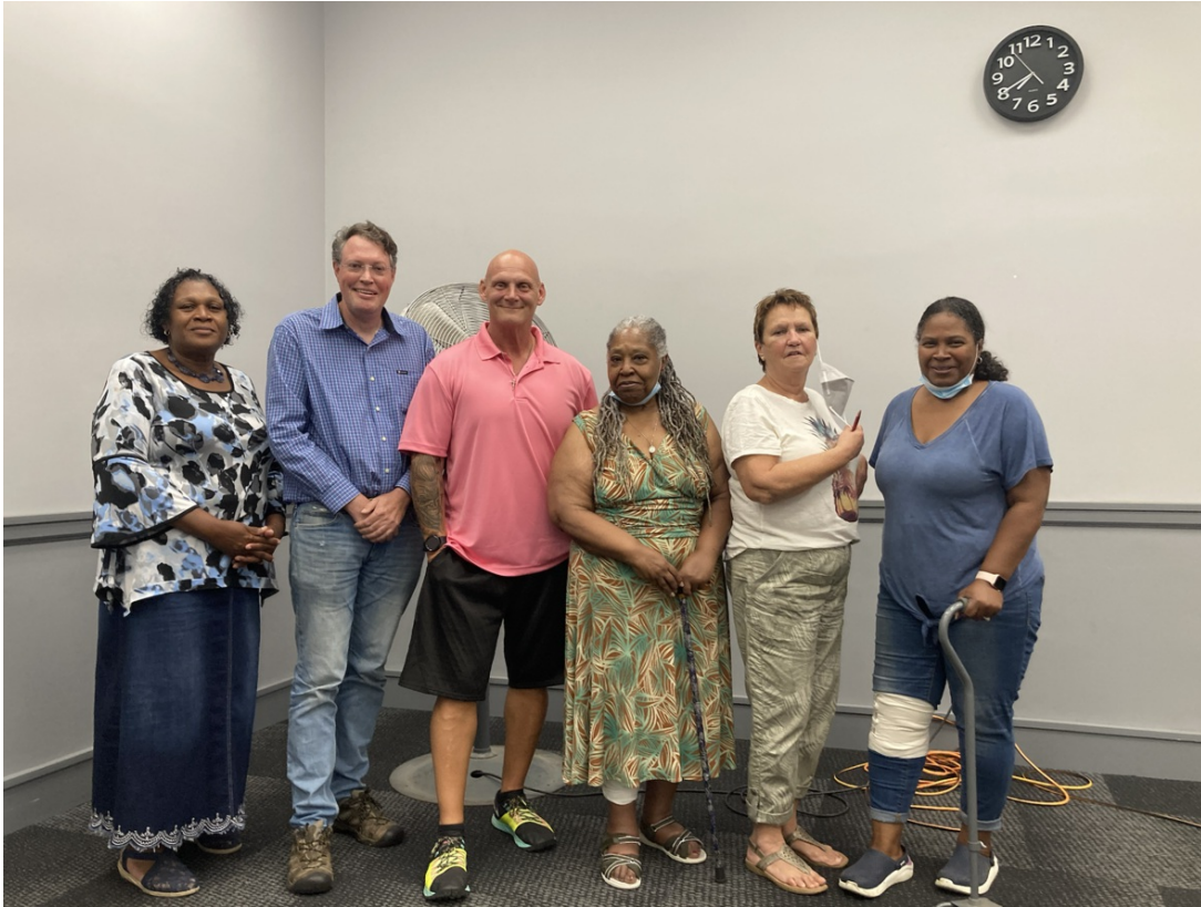
The newly elected Board of Trustees for New Forest Cemetery

New Forest Cemetery has a Facebook page, which you can find just by clicking the link provided below.