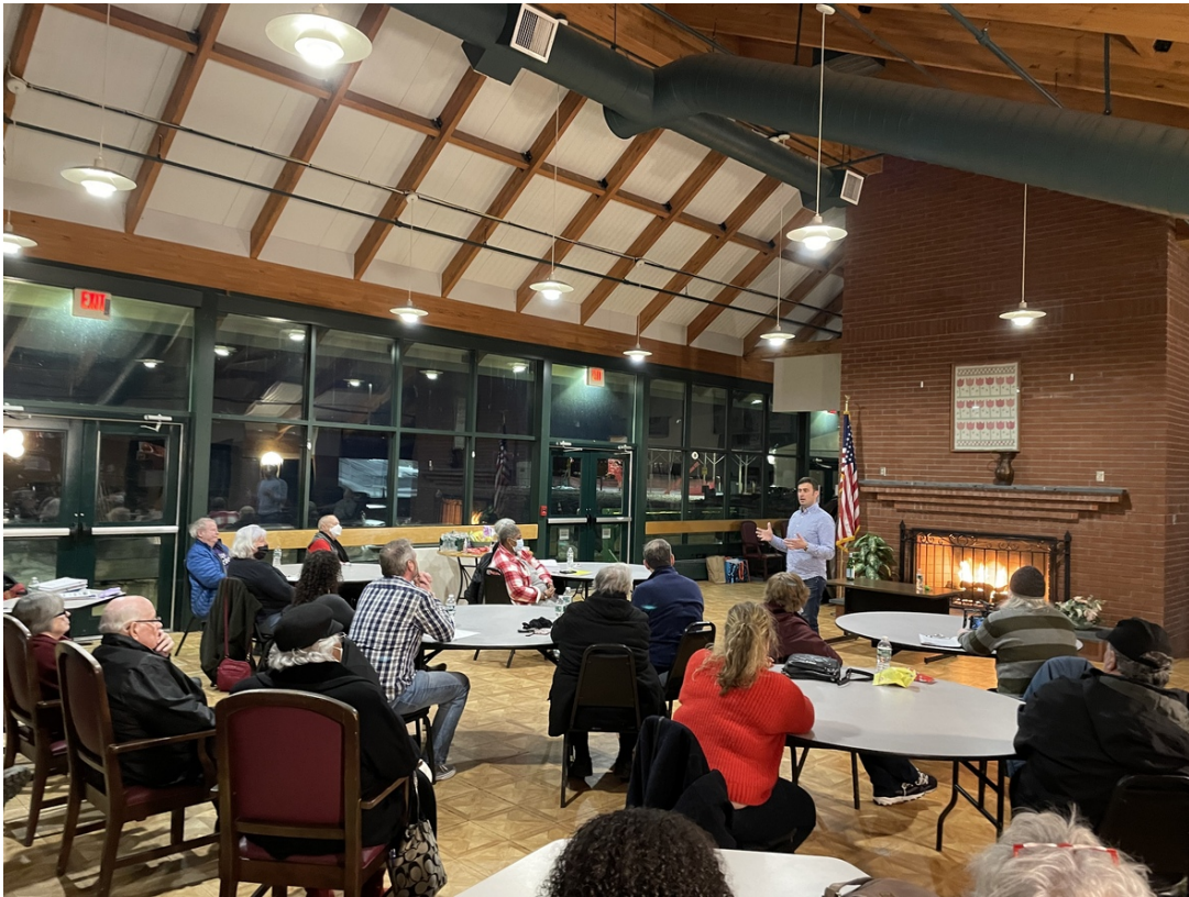
Photo: an image of a SUNA meeting at the Ski Chalet at the Parkway Rec Center

The South Utica Neighborhood Association meets every month at the Parkway Rec Center. Sign up for their Newsletter so you can stay informed of what's going on in South Utica.