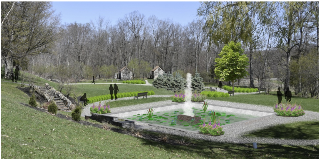
An artist's rendering of how beautiful the restored Lily Pond will be.

Olmsted City is a program of the Landmarks Society of Greater Utica, a 501 (c) 3 nonprofit dedicated since 1974 to historic preservation. All donations to Olmsted City are tax deductible. Olmsted City is volunteer-driven and has no paid employees; only 7% of what we raise goes toward overhead (mostly communications). Please help us make this happen! For more information, please visit our Facebook page and our website. You can also simply mail a check made out to "Olmsted City" to Olmsted City, PO Box 8597, Utica, NY 13505.