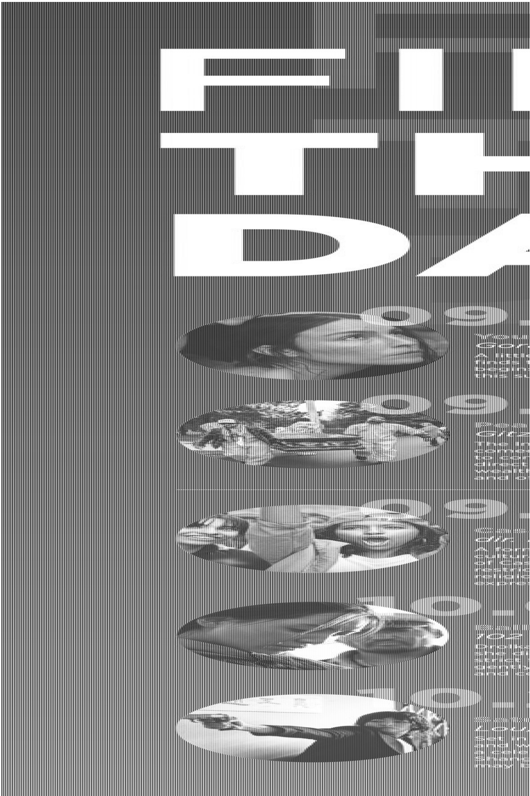
Fall 2022 Utica University Film Series Dates and Descriptions