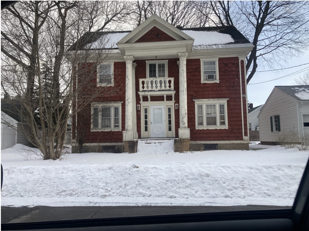
A property at 2803 that has been vacant for several years, much to the dismay of the neighbors.

Meanwhile, it is my firm belief that this Ordinance will give our government another means by which to address the problem of vacant properties, and thereby make all of us better off. It will not solve all of our problems overnight, but it does move the needle in the right direction.