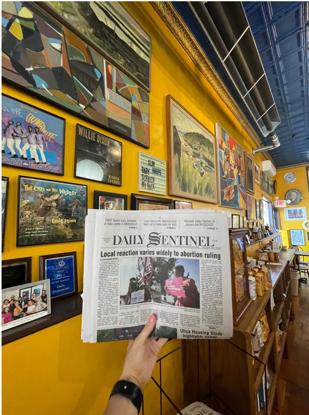
Photo: an image of someone holding up the Daily Sentieneel newspaper inside Cafe Domenico

Utica news as well as that from Rome. And now you can buy this new daily local paper at Cafe Domenico.