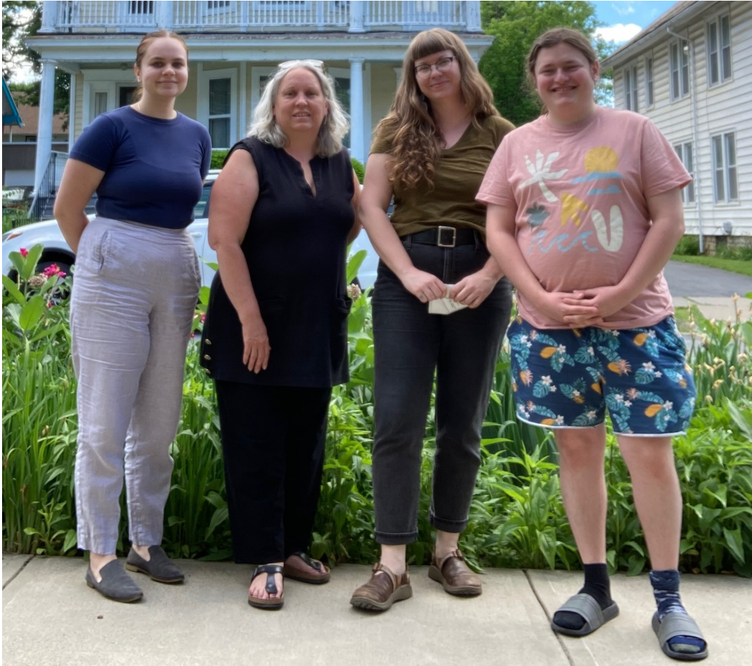
Our two interns and Internship Coordinator, and myself.