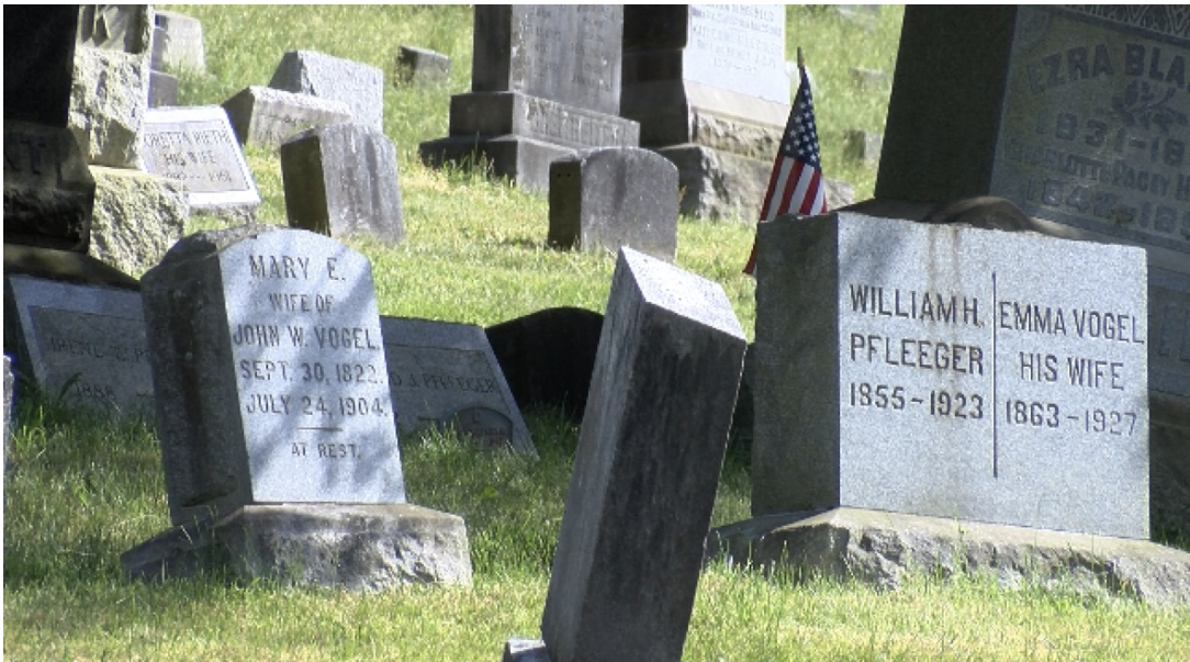
Image: headstones in New Forest Cemetery