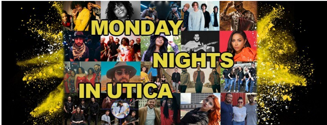
Photo: an image of several different musicians and musical groups and the words "Monday Nights In Utica"