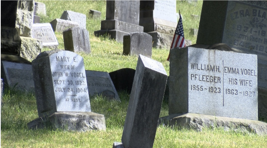
Image: headstones in New Forest Cemetery