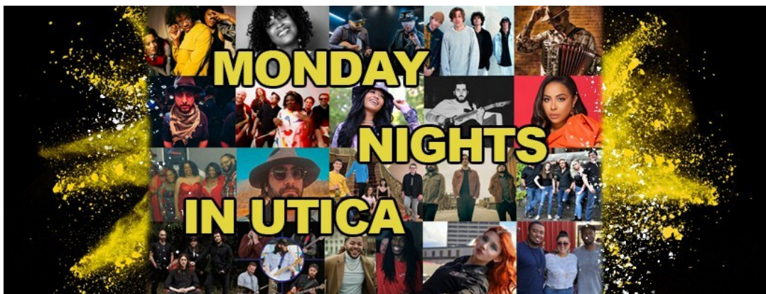
Photo: an image of several different musicians and musical groups and the words "Monday Nights In Utica"