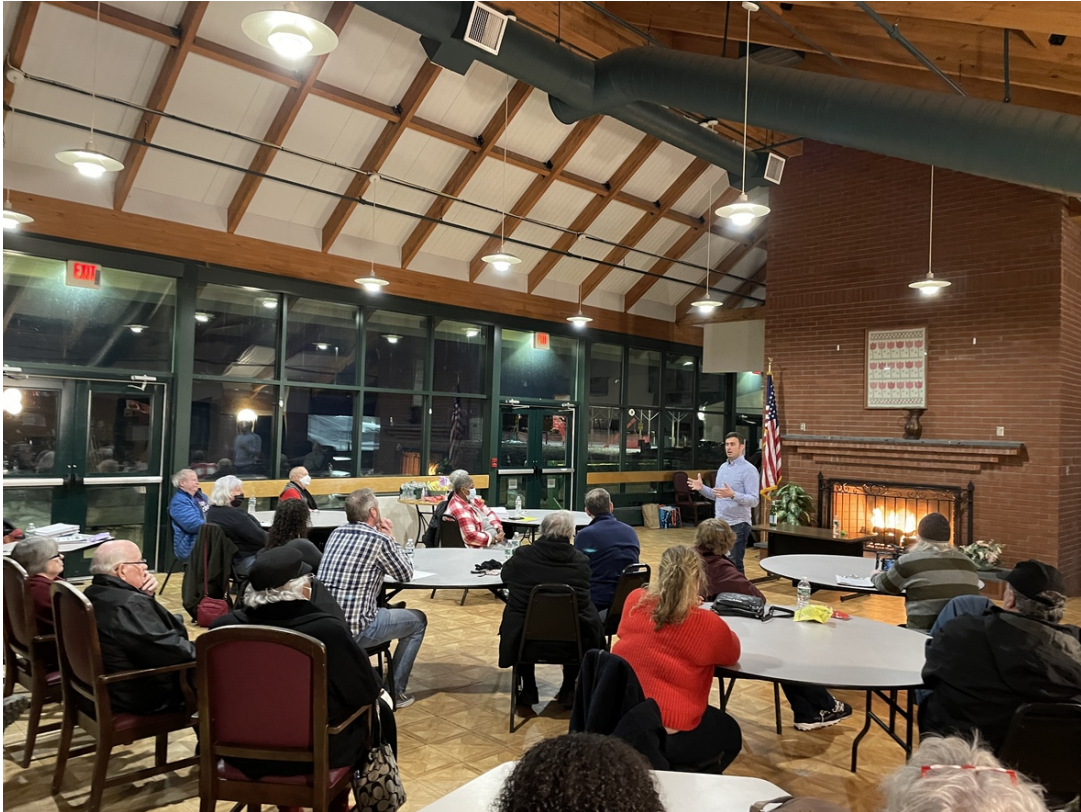
Photo: an image of a SUNA meeting at the Ski Chalet at the Parkway Rec Center

decided to suspend meetings for July & August. But they are still busy reaching out to the community and keeping people informed. Sign up for their email in order to stay in the loop.