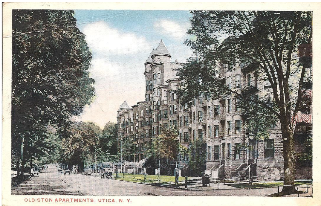
Photo: an historic image of the beautiful Olbiston Apartments

But we need your input - please participate in our Housing Study by answering a few questions. We need to hear from everyone, so no matter who you are or where you live, please help us out!