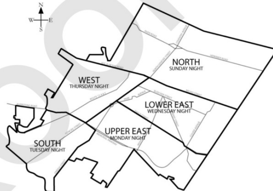
CITY OF UTICA GREEN WASTE COLLECTION ROUTES

Between May 28 – September 30, green waste MUST be in containers.