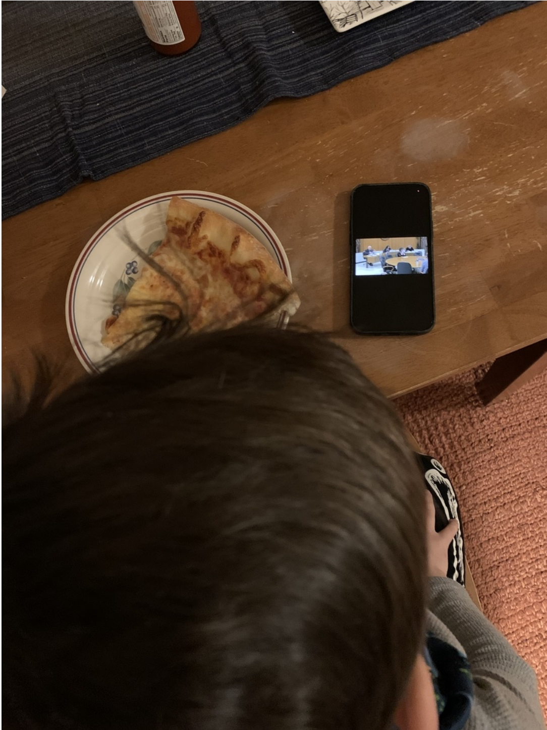
Photo: an image of a young child watching a Common Council meeting on a phone while eating pizza.

pre-meeting conference is at 6pm, and the Council meeting is at 7pm.