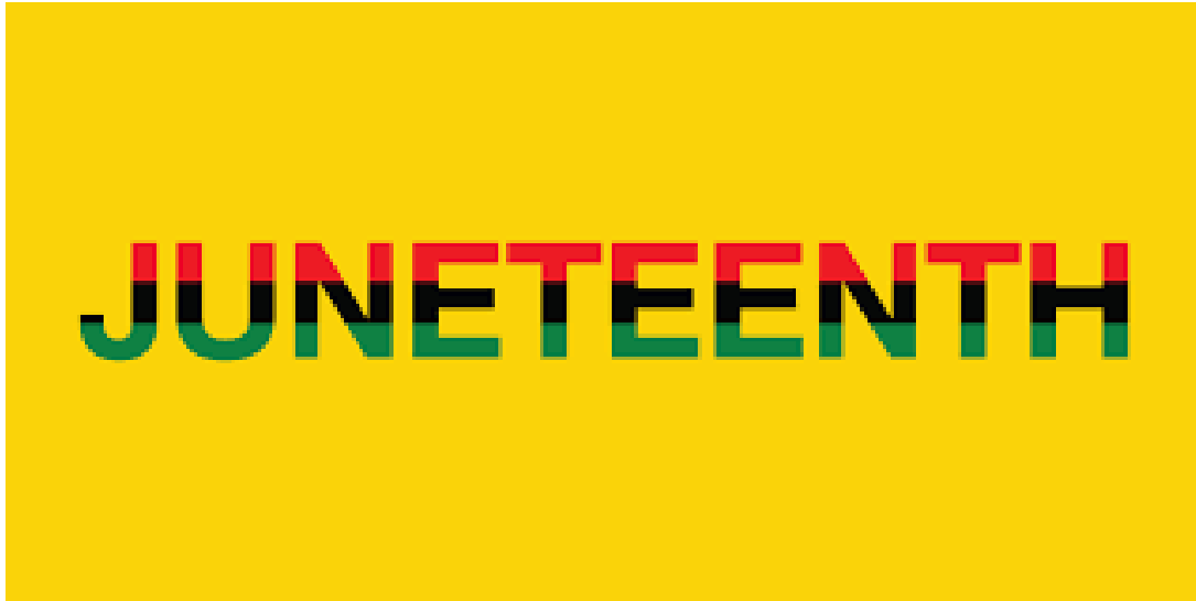
Photo: an image of the word "Juneteenth" in the colors of the pan-African flag: red, black, and green, on a yellow background

The best thing to do on Monday nights in Utica all summer long!