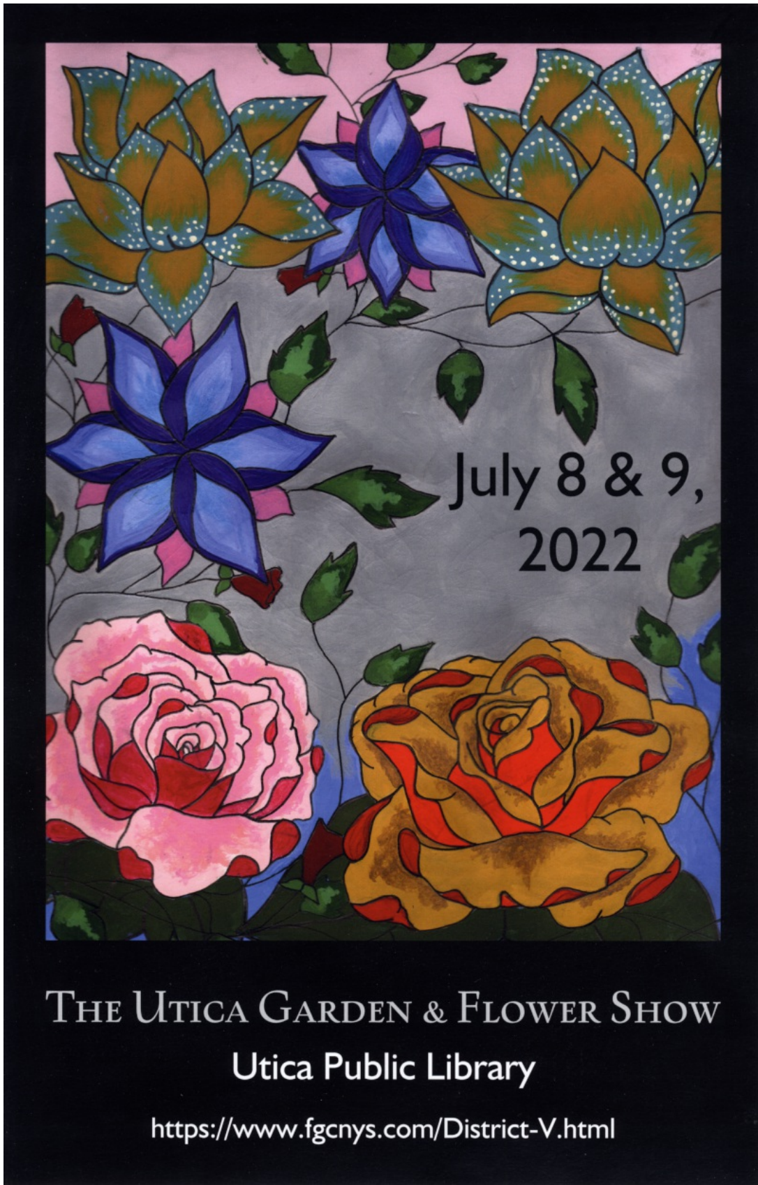
This photo shows a very nicely designed poster for the Utica Flower Show and Garden Tour.