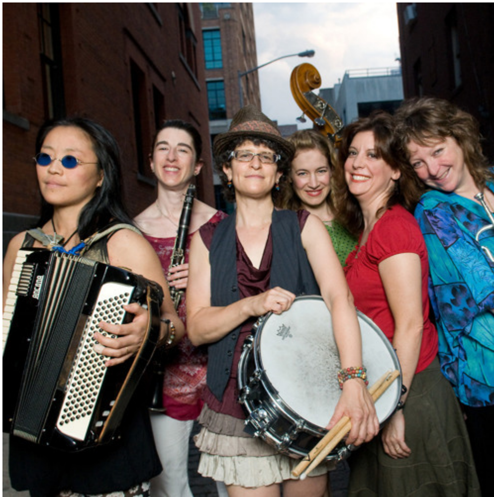
Photo: an image of six happy women in an urban setting with a variety of musical instruments

One of the best things about Utica is our ethnic and cultural diversity. From the New Englanders who first settled here in the 18th century, to the new arrivals from Ukraine and Somalia who continue to arrive today, Utica has long been populated by a heady mix of people from all over the world. This includes Jewish people of course. The Jewish Community Center on Oneida Street in South Utica is organizing a new event this year - JEWtica! It will be a big, happy festival, with traditional Kosher food, music, and cultural activities for everyone. So come enjoy a knish, and listen to some up-to-date and high energy Klezmer music. All sorts of details can be found at the link below.