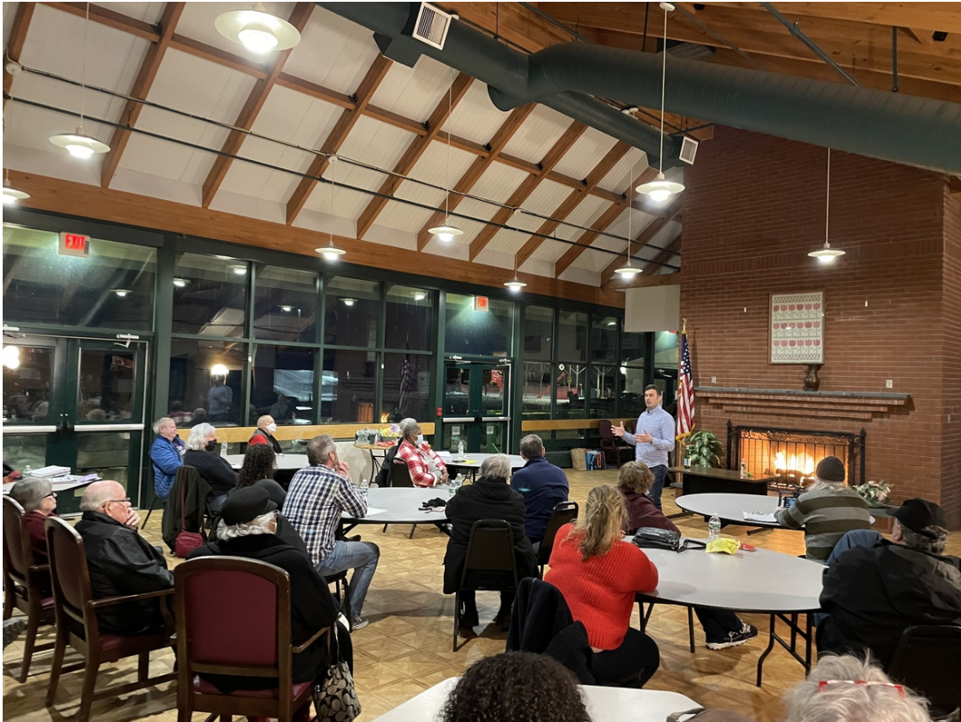
Photo: an image of a SUNA meeting at the Ski Chalet at the Parkway Rec Center

The South Utica Neighborhood Association continues to meet on the second Monday of every month at 6pm in the Ski Chalet at the Parkway Recreation Center. You can sign up for their regular newsletter just by following the link below. I am there every month by 5:30 to listen to constituents and learn about issues of concern to them.