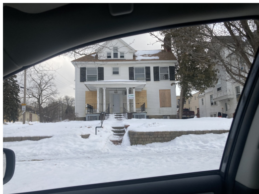
Sunset & Barton Avenues