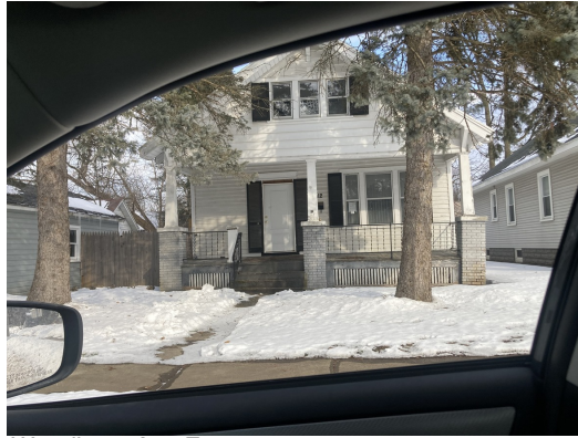
Woodlawn Ave East