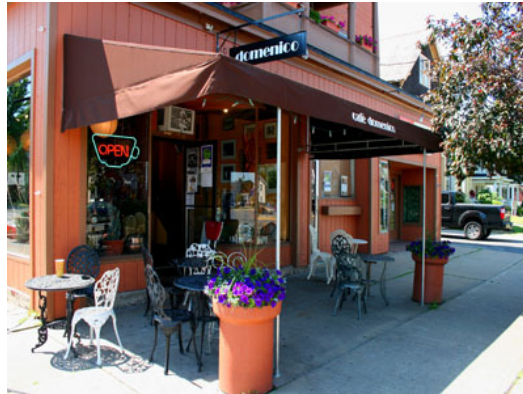
Cafe Domenico is located at 2011 Genesee Street

Many of us know about the good, community-building work that Handshake.City does. They support the local, independent businesses that do and should form the economic base of a thriving Utica. In 2018, they set up a great improvised market place next to PJ Green's just off North Genesee Street. They offered a terrific place for local artists and crafters to sell their wares, and for members of the community to gather and build up community.