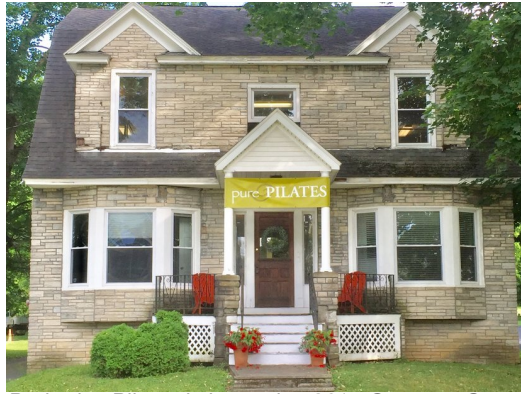
Bodywise Pilates is located at 2615 Genesee Street.